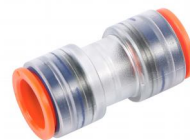
Micro Duct Connector