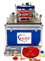
Fiber Blowing Machines