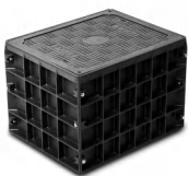
Telecom Manhole Chamber