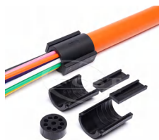
Divisible Duct Sealing- 40~63mm(HT)